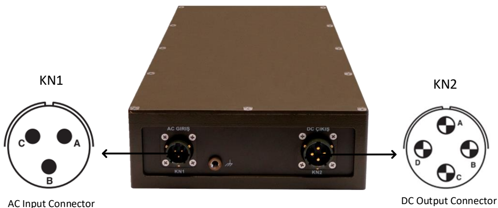
Figure 3: Connector Interface

The unit has two connectors for power input and power output, 'KN1' and 'KN2'. Part numbers and pin information are given below.