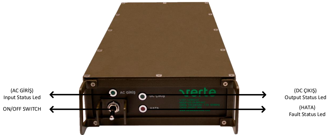
Figure 2: Front Panel

There is a switch on the front panel to control the unit and 3 LEDs to monitor its status.