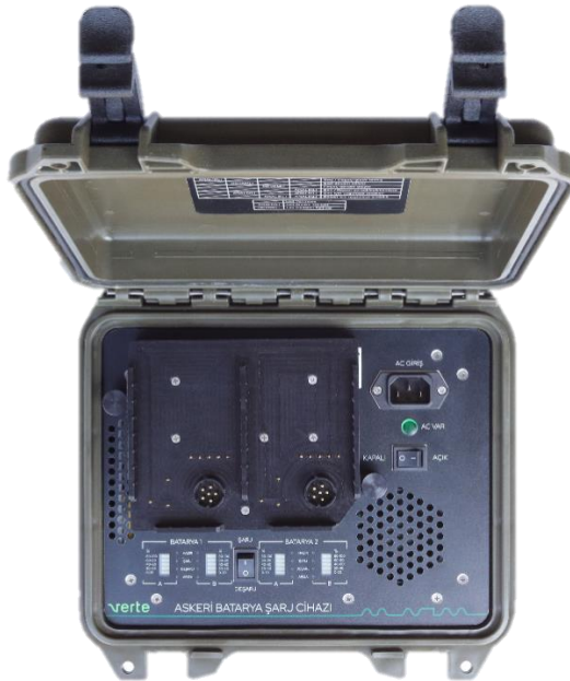
Figure 1: MILCHAR-US-4B14-200W front panel view

Battery charger panel components are described below and shown in Figure 2.