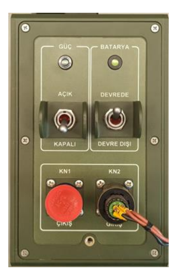
Figure 6: Front Panel View In Charging Mode

When there is voltage of 27V or higher at the KN2 (input) connector and the battery switch is turned on, the unit will charge the battery. In this configuration, the system can be used as a battery charger