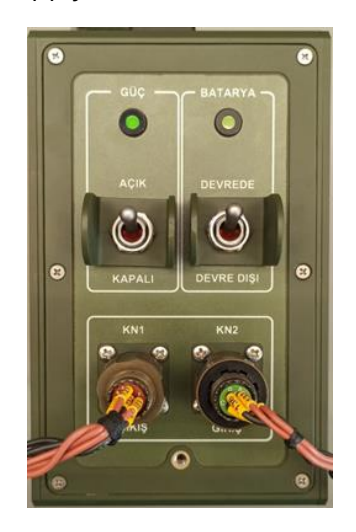
Figure 5: Front Panel View In Uninterruptable Power Supply Mode

In the event of a power outage (when the input voltage drops below 26V), the unit activates the battery, and a voltage of 25.8V will be present between pins A-F and a voltage of 12V will be present between pins B-C on the KN1 (output) connector. In this way, the system can be used as an uninterruptible power supply.