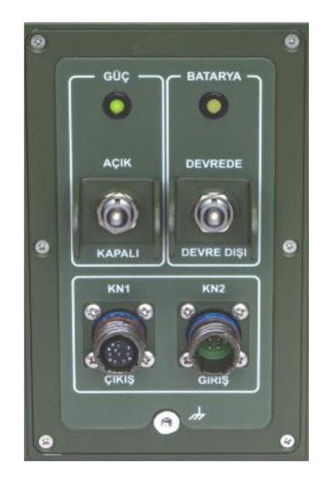
Figure 1: DUPS-US-28M-300-A02 front panel view