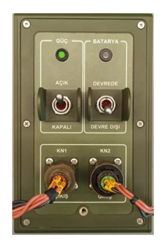
Figure 3: Front Panel View In Power Supply Mode

When there is voltage at the KN2 (input) connector and the power switch is turned on, a voltage equal to the input voltage will be present between pins A-F, a voltage of 12V will be present between pins B-C and a voltage of 16V will be present between pins E-D on the KN1 (output) connector. In this configuration, the system can be used as a power source without activating the battery.