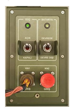
Figure 4: Front Panel View In Portable Power Supply Mode

When no other power source is available, if both the battery switch and the power switch are turned on, a voltage of 25.8V will be present between pins A-F, a voltage of 12V will be present between pins B-C and a voltage of 16V will be present between pins E-D on the KN1 (output) connector. In this configuration, the system can be used as a portable power supply.