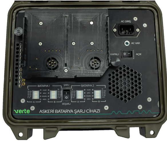
Figure 1: MILCHAR-US-4B14-200W front panel view

Battery charger panel components are described below and shown in Figure 2.